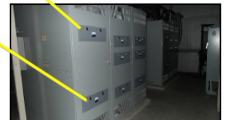
Cabinet A, B, C

Consultants chose large-format IR windows in several sizes for the project