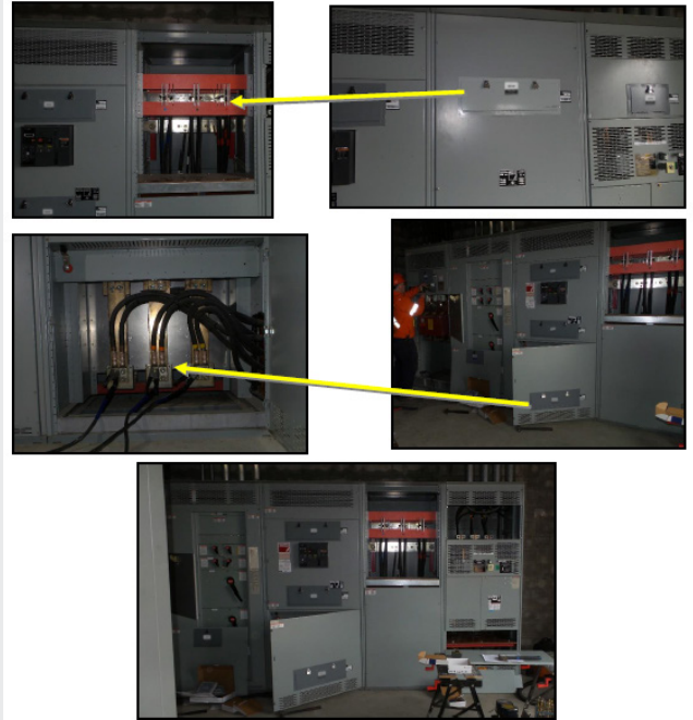
The bottled company installed 24-inch large-format IR windows in main breaker buss cabinets

Installation Requirements: Incoming line connections Main Breaker