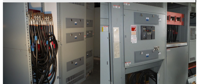
Incoming line connection and main breaker cabinets were also fitted with 24-inch windows

Imagery for illustration purposes only. Equipment described herein is subject to US export regulations and may require a license prior to export. Diversion contrary to US law is prohibited. ©2019 FLIR Systems, Inc. All rights reserved. 07/19-19-1596_EN